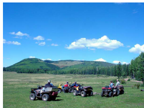
"Arizona ATV Outlaw Trail—Terry Flats"